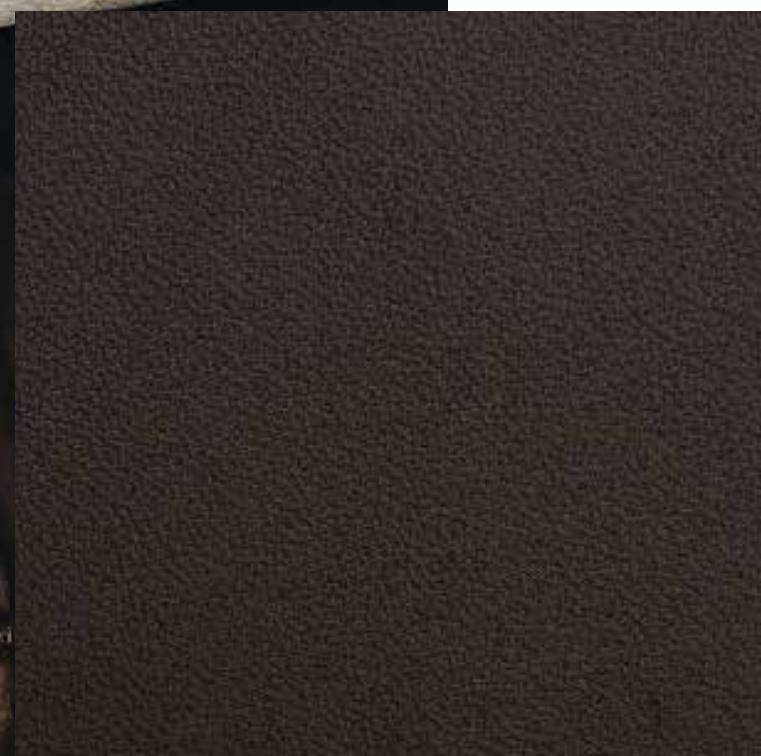
Testa di moro