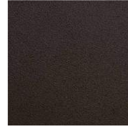
Testa di moro